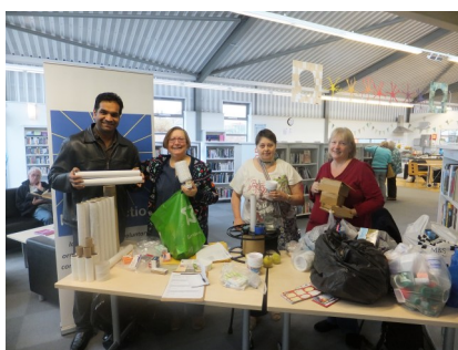
Win on Waste—Hamworthy East